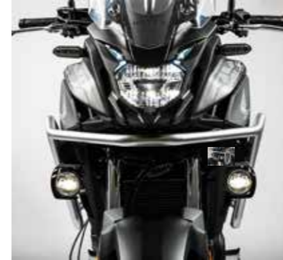
Fog Lights Set 08ESY-MKP-F0G19

Set of 2 additional front LED headlights with all necessary components for fitment to the front side pipe also included in this set. Increase the visibility for the rider and make him more noticeable for the traffic surrounding him. € 806,32 (tva inclus)