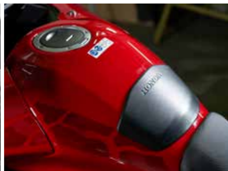
Tank Pad 08P70-MGH-J20 Helps to protect the tank from scratches. € 52,11 (tva inclus)