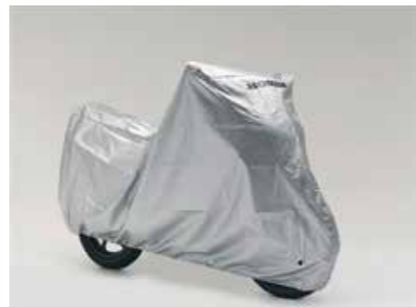
Outdoor cycle cover XL 08P34-BC2-801 Protects paintwork against U.V. rays. Water-resistant breathable fabric that allows the bike to dry while covered. Rope to tighten the cover to avoid fluttering. Two holes in front lower area for easy introduction of U-lock. Not suitable for bikes with top box and/or panniers installed. € 85,14 (tva inclus)