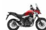
Grand Prix Red