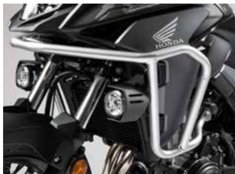
Front Side Pipe 08P72-MKP-J80ZA Improve the protection and gives a mounting for the fog lights (sold separately) € 249,83 (tva inclus)