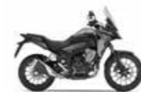
Mat Gunpowder Black Metallic