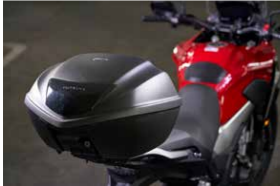
35L Top Box 08ESY-MJX-TBWK

35L Top Box designed to be operated with your CB500X key. This set includes all the components to mount the top box on the bike and the key system. € 337,79 (tva inclus)