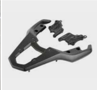
Rear Carrier 08L71-MGZ-D80ZA

35L Top Box designed to be operated with your CB500X key. This set includes all the components to mount the top box on the bike and the key system. € 337,79 (tva inclus)