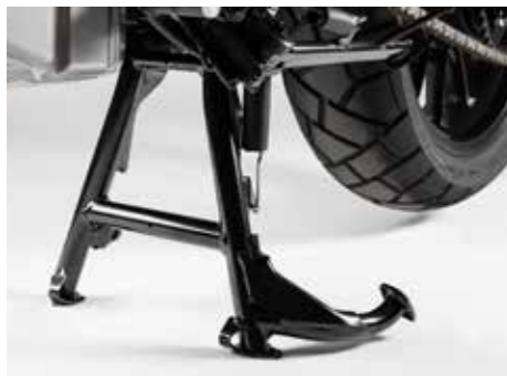
Main Stand Kit 08M70-MKP-J80 Facilitates cleaning and rear wheel maintenance, plus allows for more secure parking on uneven surfaces. € 149,30 (tva inclus)