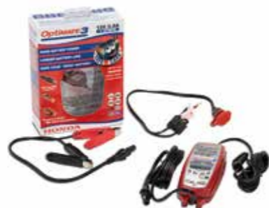
Honda Optimate 3 08M51-EWA-601E | 08M51-EWA-601U Suitable for all types of 12V lead-acid batteries of rated capacity from 3 to 50Ah. Effective on very neglected batteries from as low as 2 Volts. No risk of overcharging. Ensured safety for vehicle electronics. 2 versions available (EU or UK market) € 101,64 (tva inclus)