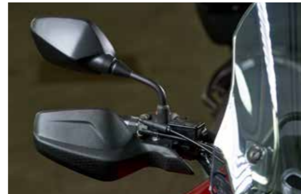
Knuckle Guards 08P70-MJW-J80

12V Power Socket allows you to power or charge electrical equipment directly from the bike. € 27,27 (tva inclus)