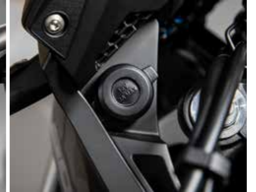
12V Socket 08U70-MKP-D80

Extremely slim heated grips which provide 360° heat around the grips. Features integrated control for maximum rider comfort and design integration. Features 3-step variable heating levels, integrated circuit to protect the battery from draining and smart heat allocation that focuses on the area of the hands most sensitive to cold. Attachment and special heat-resistant cement are also included in this set. € 379,75 (tva inclus)