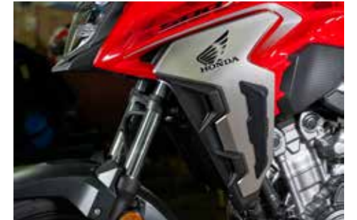
Deflector kit 08R71-MKP-J80

Smoked windscreen for improved comfort and a sporty look. Size and shape are identical to the standard clear wind screen. € 55,09 (tva inclus)