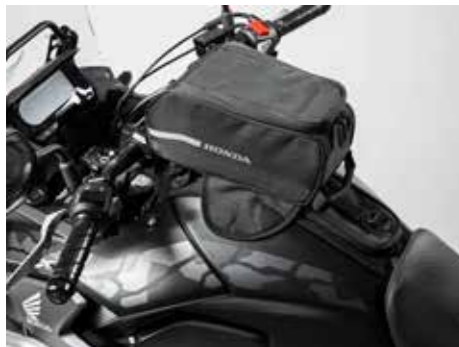
Tank bag 08ESY-MKP-TKB19B

Black nylon bag with silver Honda wing logo on front pocket. Expandable from 15 to 25L. The front pocket can contain an A4-size file. Comes with adjustable shoulder belt and carrying handle. € 66,60 (tva inclus)