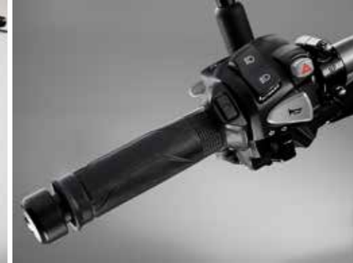
Grip Heaters Set 08ESY-MKP-HG19

Set of 2 additional front LED headlights with all necessary components for fitment to the front side pipe also included in this set. Increase the visibility for the rider and make him more noticeable for the traffic surrounding him. € 806,32 (tva inclus)