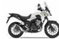
Pearl Metalloid White